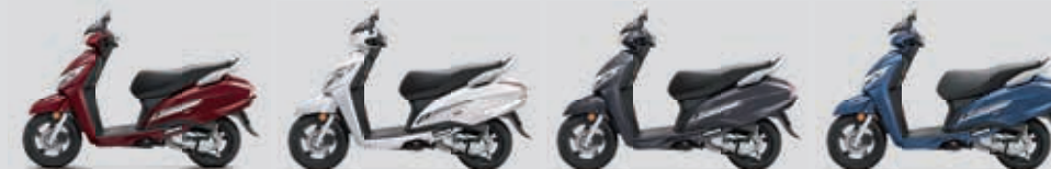
Rebel Red Metallic Pearl Precious White Heavy Grey Metallic Midnight Blue Metallic

*The technical specifications and design of the vehicle may vary according to the requirements and conditions without any notice • *Distance to empty, real time and average mileage readings may vary as per variant and riding conditions • Activa 125 meets Bharat Stage VI norms • Product shown in the picture may vary from actual product available in the market • Accessories shown in the picture are not part of standard equipment • The technical specifications mentioned are for Deluxe variant • ^Mileage has increased by 13% for Activa 125 BS-VI Deluxe variant as compared to the Activa 125 BS-IV Deluxe variant • All features and colours may not be part of all variants • **Conditions apply